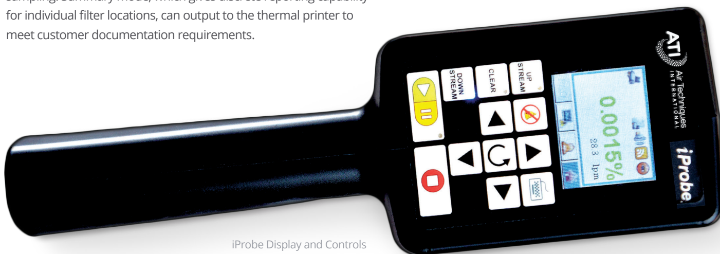
iProbe Display and Controls