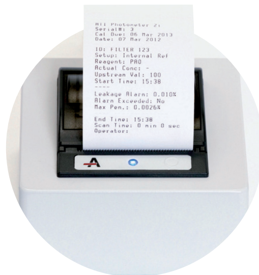
Optional Printer & Sample Report

Three unique report functions are now available with the 2i through the USB or optional thermal printer interface. Continuous mode offers the same output as ATI's legacy photometers to ensure backward compatibility. Monitoring mode provides the ability to collect data at user defined intervals for long term sampling. Summary mode, which gives discrete reporting capability for individual filter locations, can output to the thermal printer to meet customer documentation requirements.